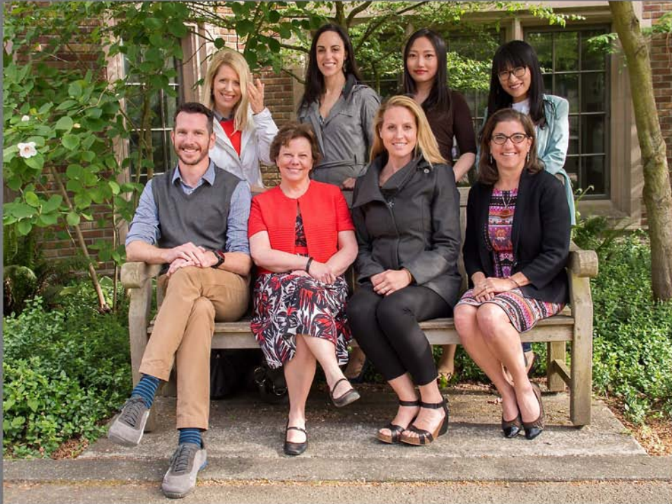
Teachers & Administrators from Happy Valley & Geneva Elementary Schools in Bellingham with their visiting teachers from China.