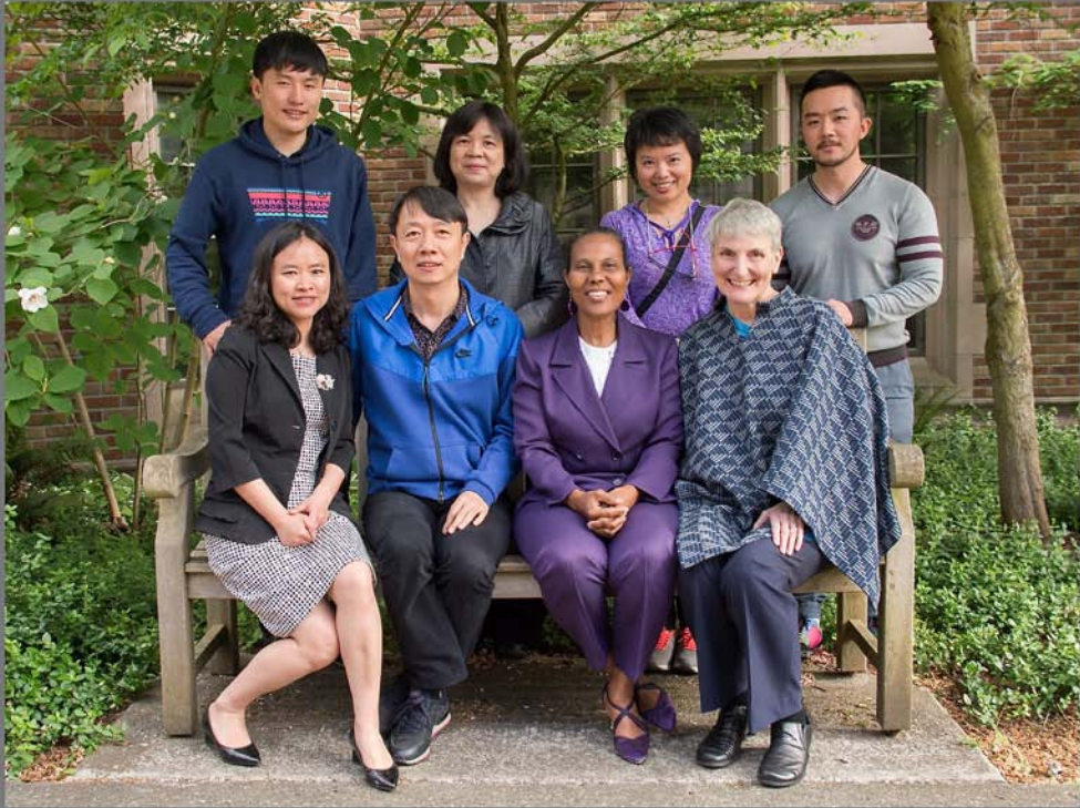
Teachers & Administrators from Chief Sealth International High School & Nankai Secondary School.