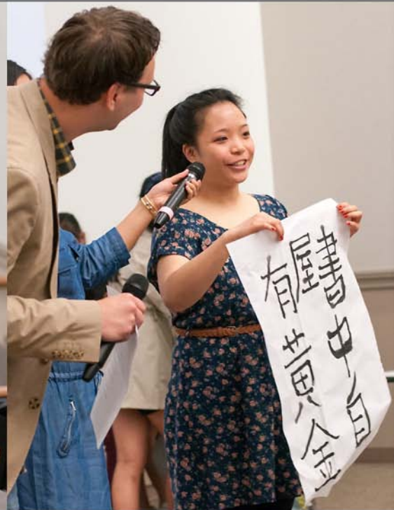
The audience enjoyed watching students participate in the Chinese Bridge Chinese Proficiency Competition for World College Students. Visual art represented one category in the competition.