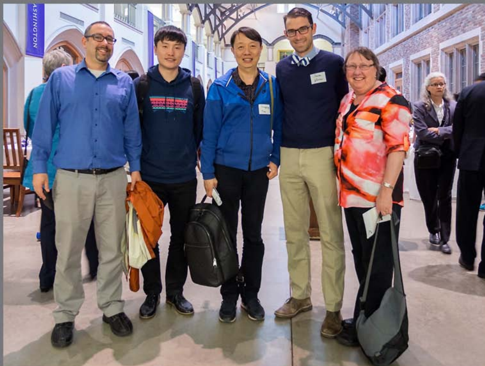
Sister School Partnership Teachers from Chongqing & Seattle 重庆和西雅图姐妹学校情深意重