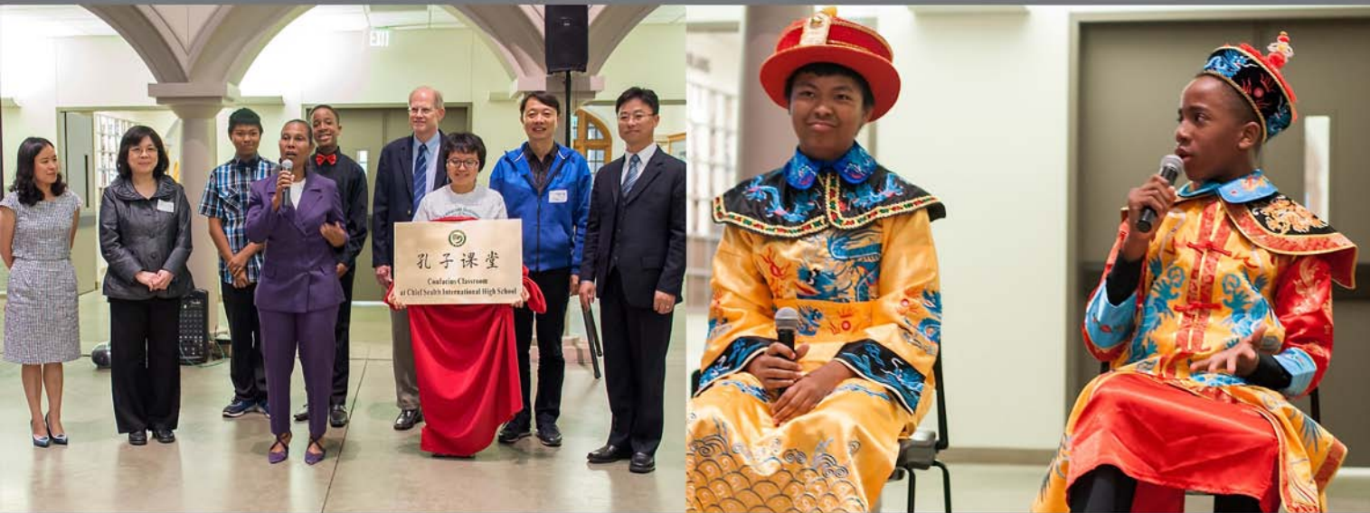
Chief Sealth International High School Confucius Classroom unveiling & student cultural performance.