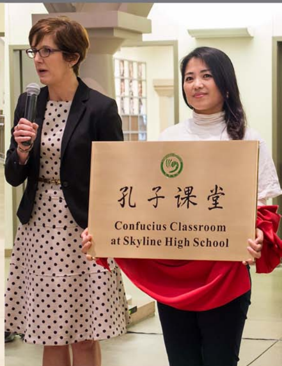
Skyline High School, Issaquah School District 伊瑟阔学区天际中学孔子课堂