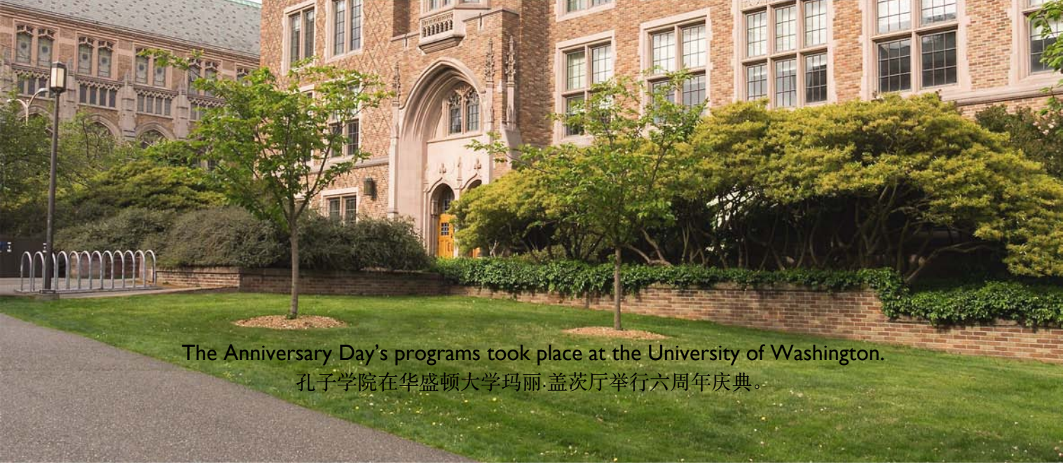
The Anniversary Day's programs took place at the University of Washington. 孔子学院在华盛顿大学玛丽·盖茨厅举行六周年庆典。