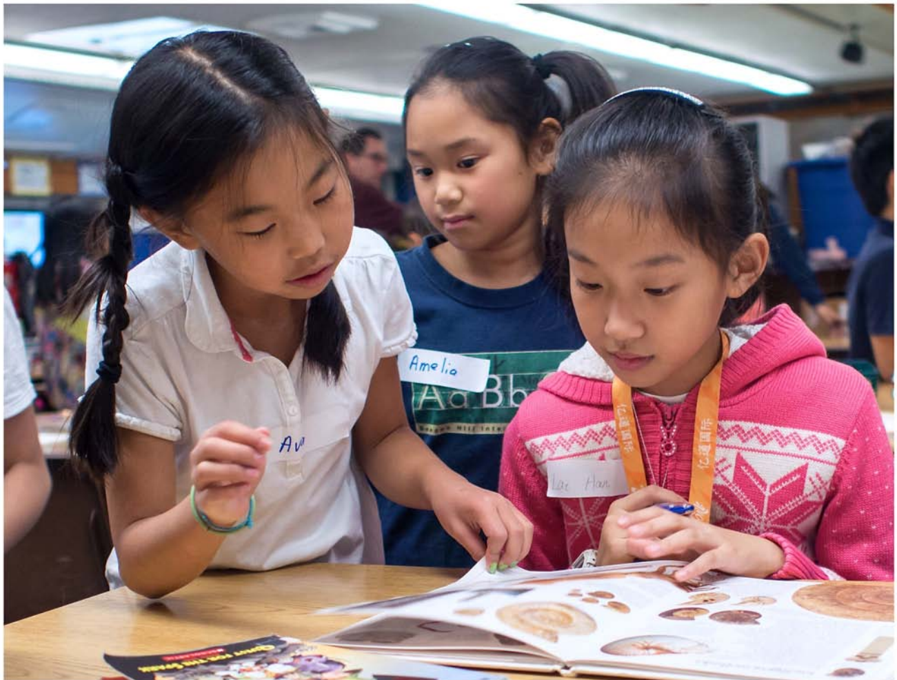
Students from China learn together with American students during their visit to Seattle