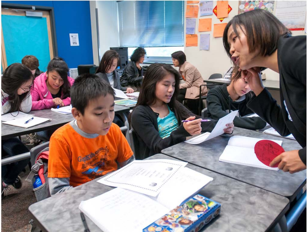
Visiting Chinese teacher at Denny International Middle School