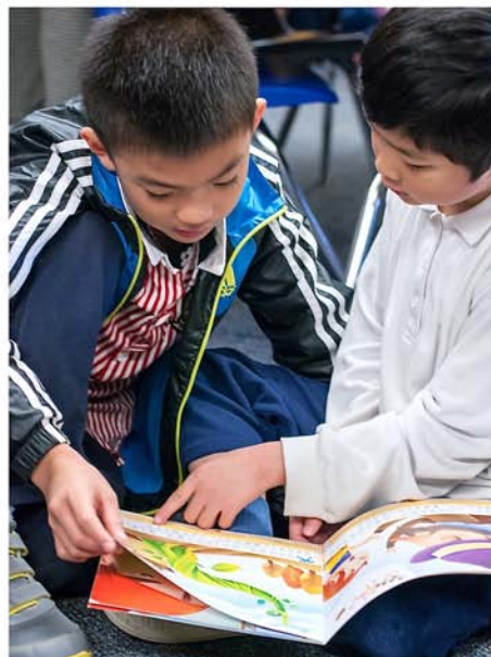
Renmin Primary students tutor Beacon Hill Mandarin Immersion kindergarteners