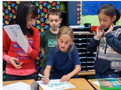
A warm farewell party for Renmin Primary visitors