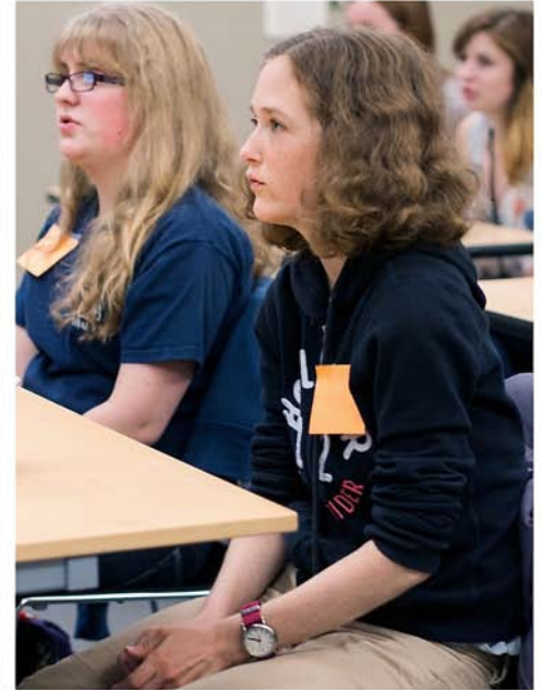
Community Chinese Corner students learn to read a menu and order food in Chinese