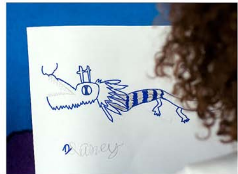
18 Chinese art teacher from Renmin Primary conducts a drawing lesson at Beacon Hill International School