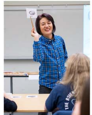
Guest teacher engages students during Community Chinese Corner held at Seattle Chinese Garden