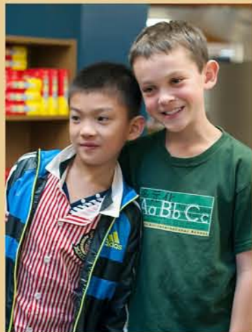
Confucius Institute of the State of Washington