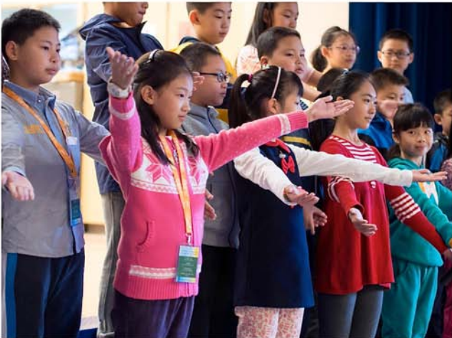
Renmin Primary from Chongqing at Beacon Hill International School in Seattle