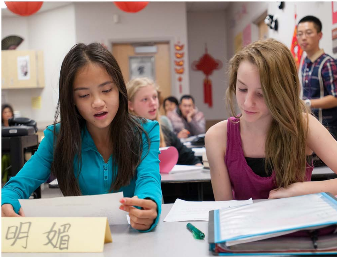
Pathfinder K-8 Chinese Language Program featuring a visiting teacher