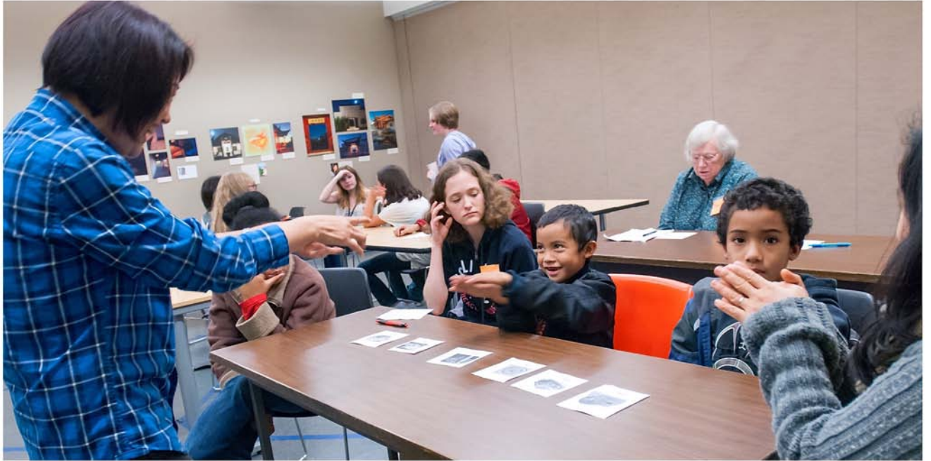
Learning language and culture at Community Chinese Corner with CIWA Chinese Director