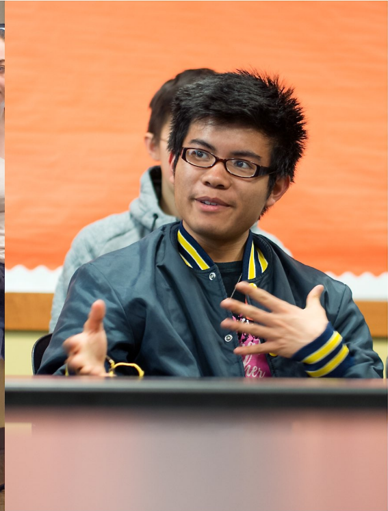
Workshop attendees eagerly respond.