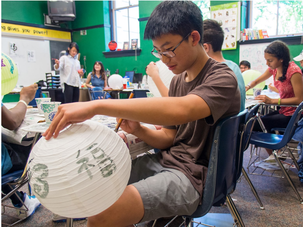
Lantern making using Chinese characters and artistic designs.