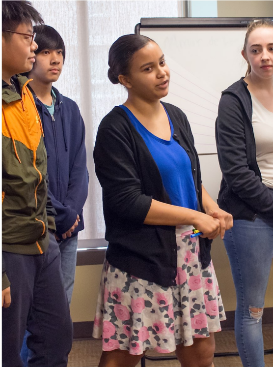
Students lead discussions on real world concerns.