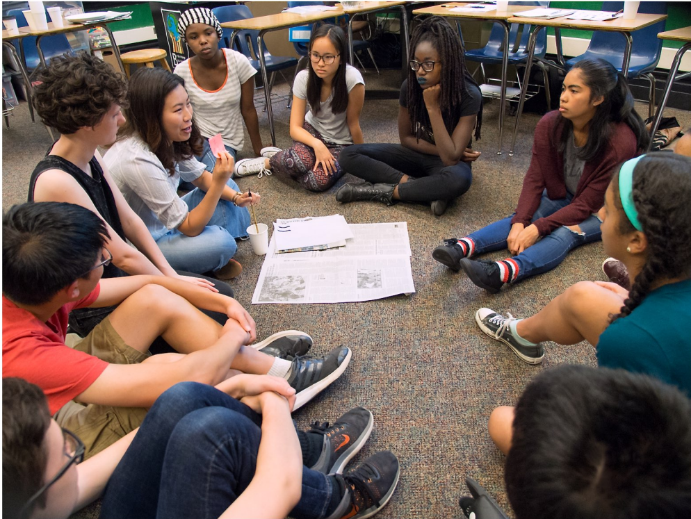
OWN Summer program Chinese class at work.