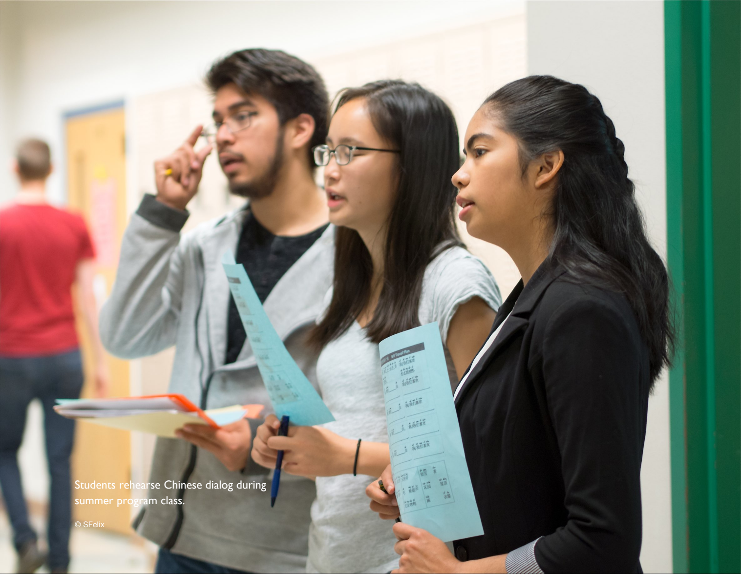
Students rehearse Chinese dialog during summer program class.