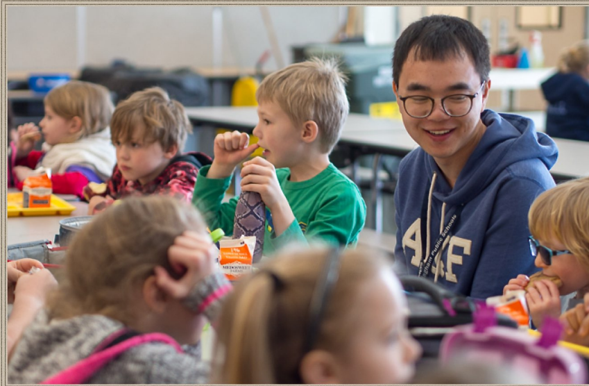
This visiting teacher has a wonderful rapport with K-5 elementary students.