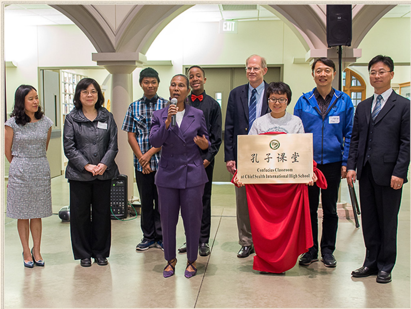
Chief Sealth International High School, Seattle School District, opened its Confucius Classroom upon this unveiling.