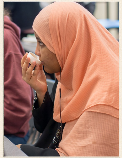
Visiting teacher from China(name) assists students with tea making process.