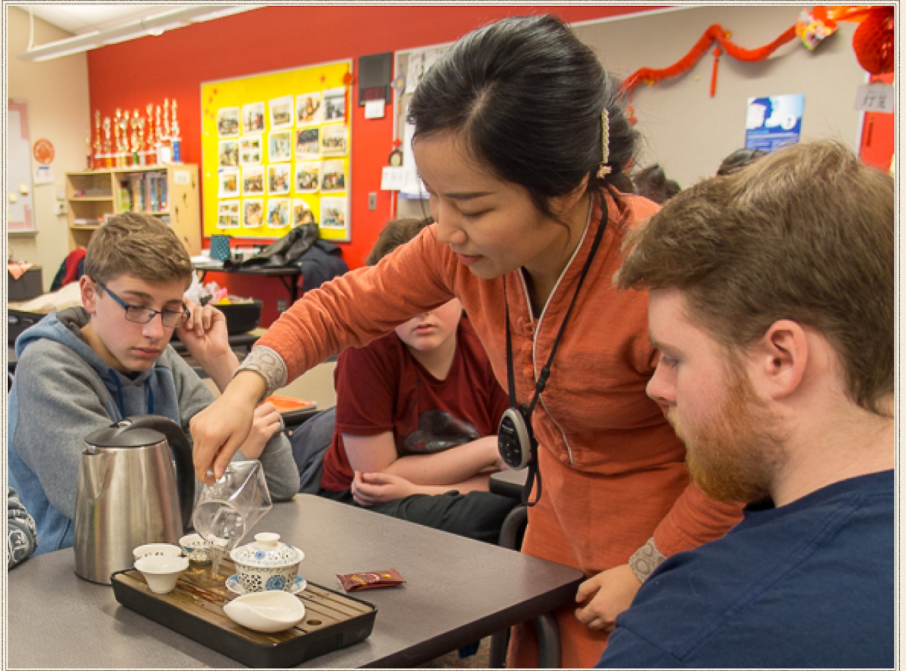
Lecturer from Chongqing (name) demonstrates tea making technique in the Confucius Classroom.