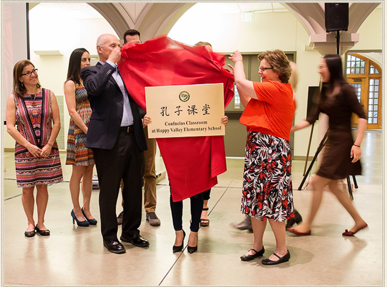
2 Unveiling at 6th CIWA Anniversary Celebration officially opened Happy Valley Confucius Classroom, Bellingham School District.