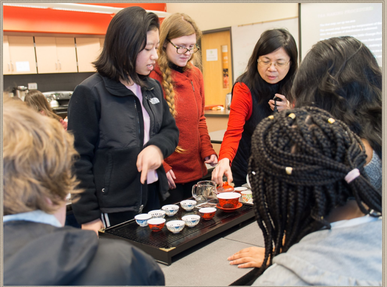
Students at Chief Sealth International High School Confucius Classroom enjoy learning Chinese tea traditions.