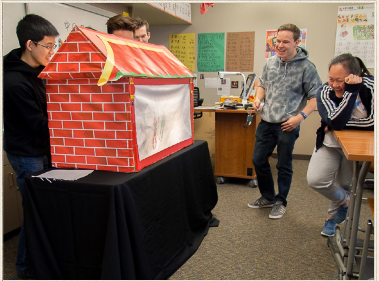
Skyline students practice their shadow puppet show for fellow students to enjoy.