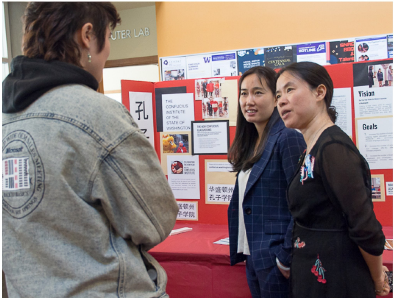
visiting China, exploring global leadership while building awareness of CIWA program offerings.