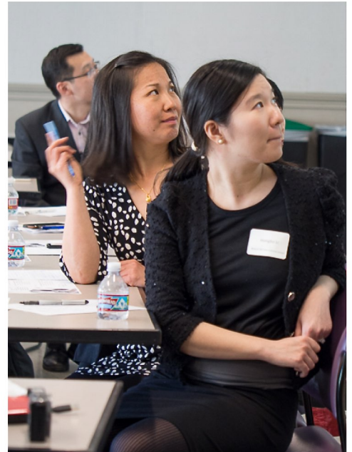
Workshops preceding the 6th anniversary celebration furthered the collaboration with China in teaching language and culture.