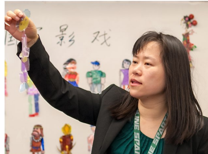
Visiting teachers introduce Chinese culture and language.