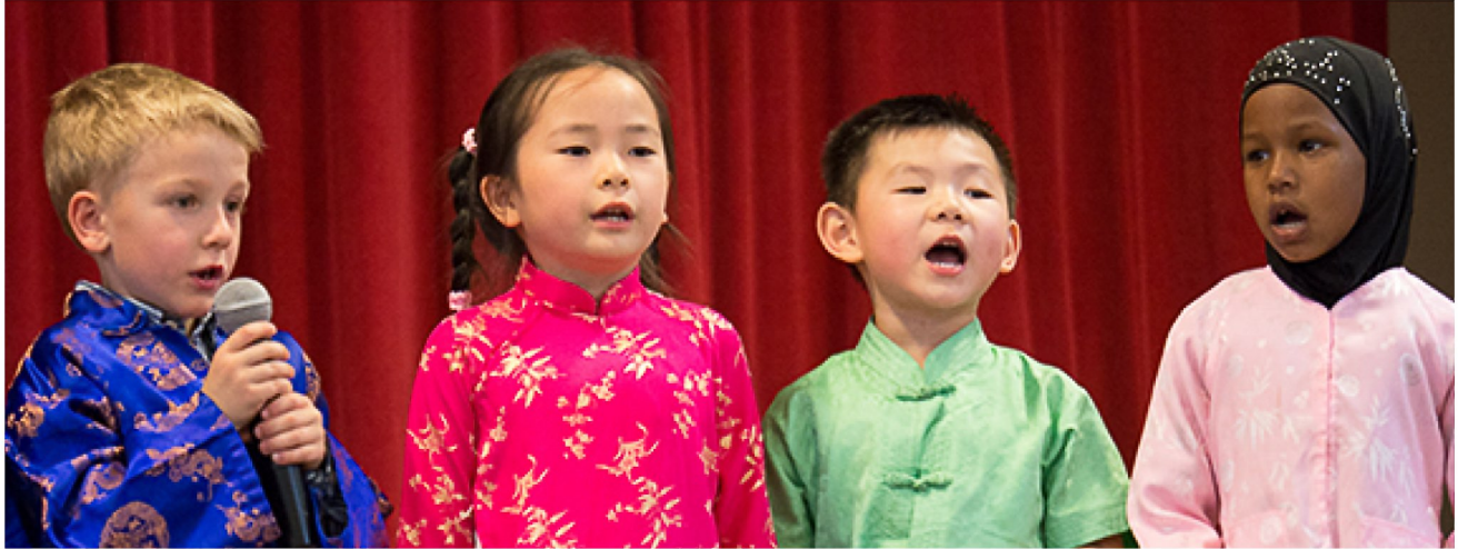
Mandarin Immersion Kindergarteners from Dearborn Elementary School perform a Chinese song at their multicultural event providing a great example of Washington's expansion of language and cultural learning.