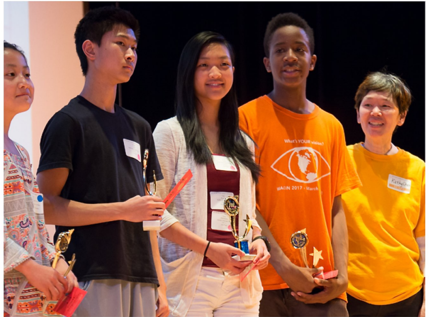
Students of all levels accepted awards for excellence in Chinese literacy.