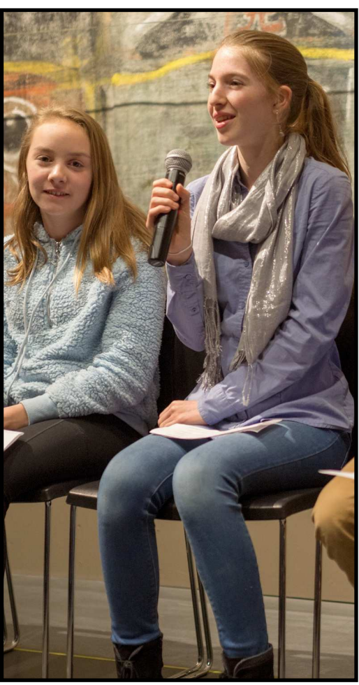
Students from Chongqing and from Seattle described their experiences while on exchange visits.