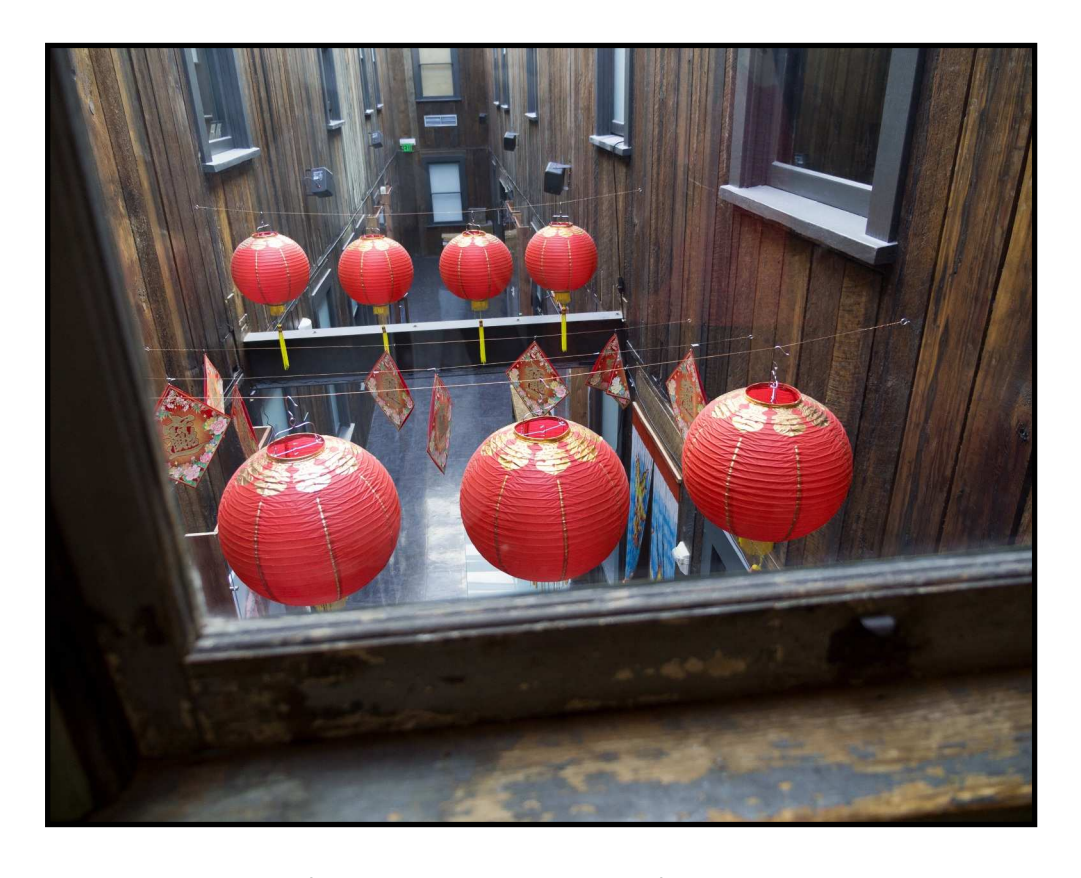
Wing Luke Museum features many historical artifacts in a building that once provided accommodations for Asian immigrants.