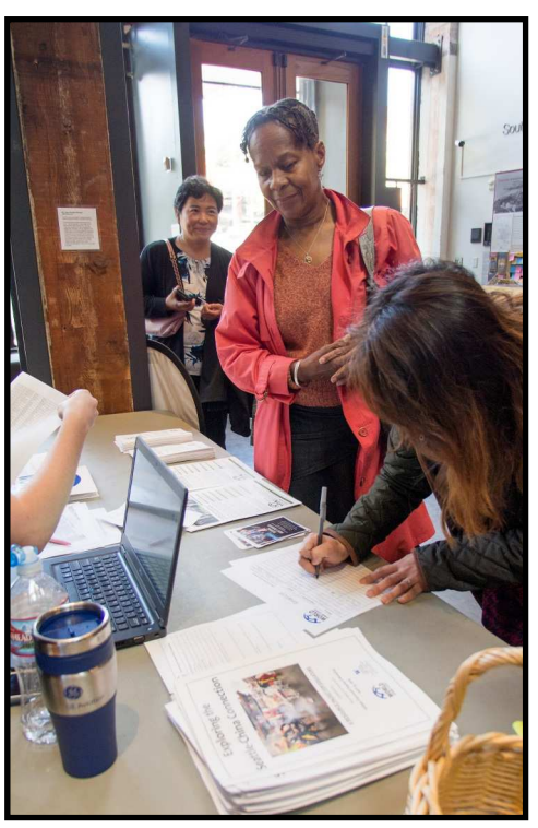
Teachers arrived early and signed in for their program.

Right: Teachers on tour of the Wing Luke Museum.