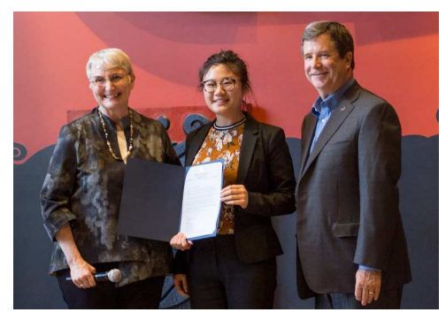
Receiving a beautiful scroll from the Chinese Consulate.