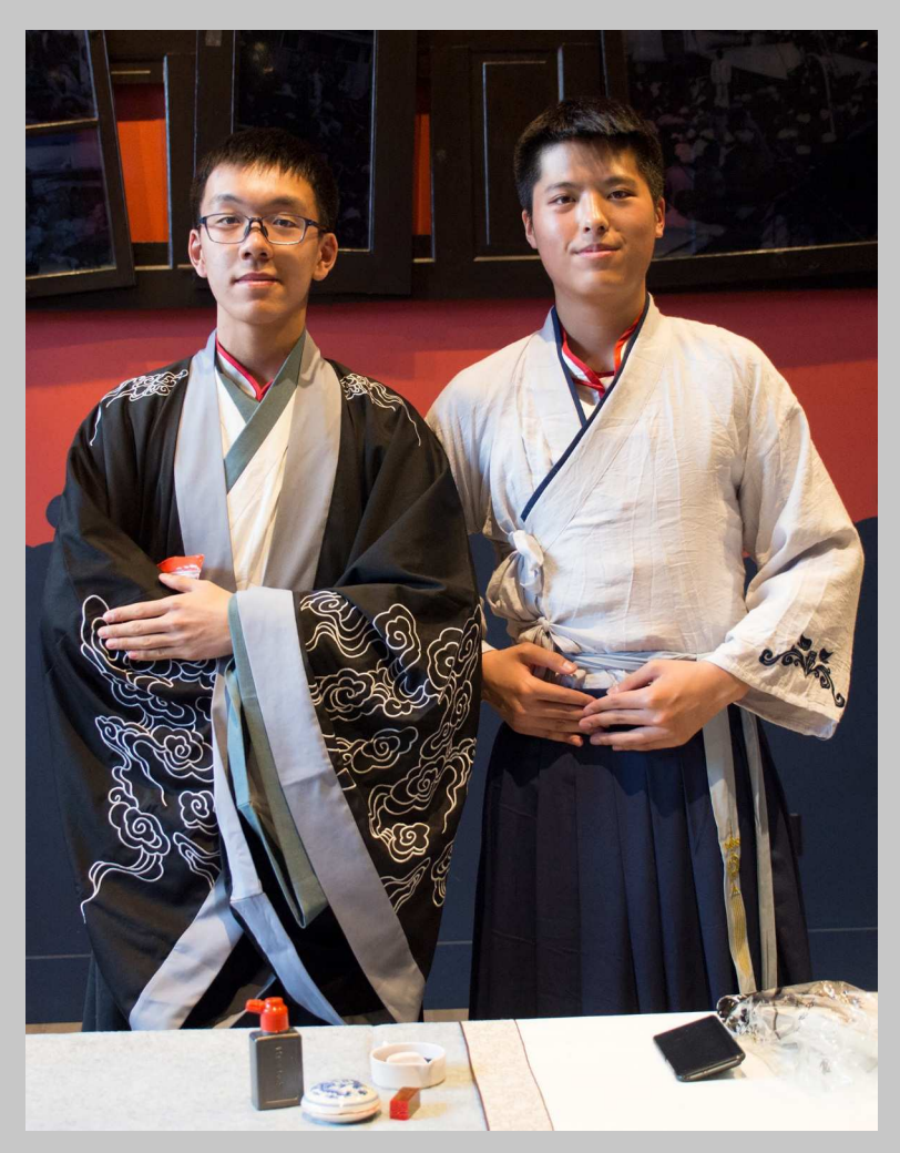
Reception socializing and preparation for cultural entertainment.